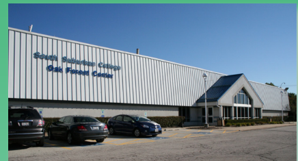
OAK FOREST CENTER 16333 S. Kilbourn Ave. Oak Forest, IL 60452 (708) 225-6000