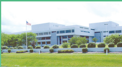
MAIN CAMPUS 15800 S. State Street South Holland, IL 60473 (708) 596-2000