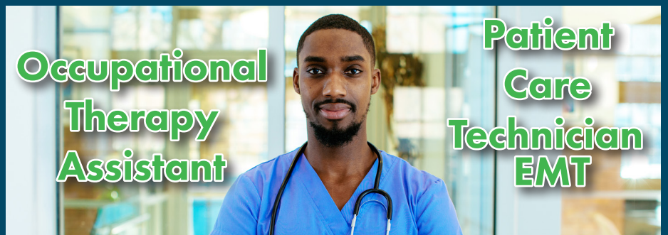
Occupational Therapy Assistant