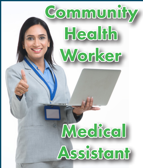
Community Health Worker