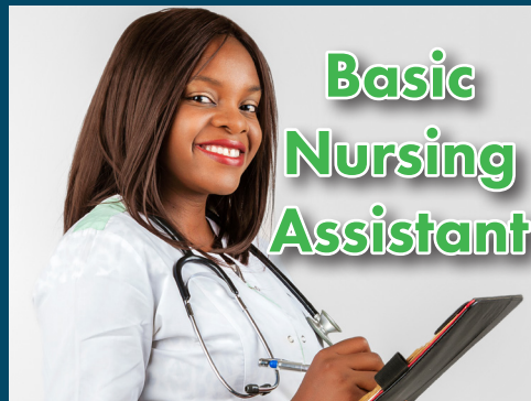
Basic Nursing Assistant